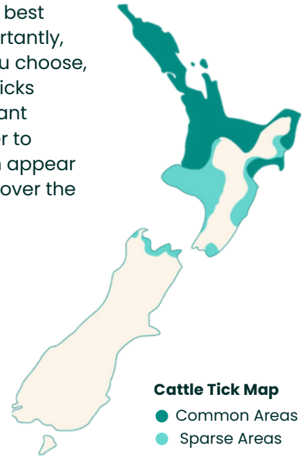
Cattle Tick Map ● Common Areas ● Sparse Areas

Most ticks reside on the head, neck, and ears, but you should take the time to check the entire body. If you see a tick, remove it carefully with tweezers and take it to your veterinarian. Your dog will need to be treated for infection.